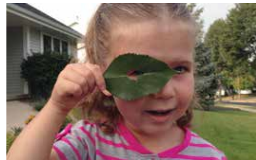
Nature through the eyes of a child.